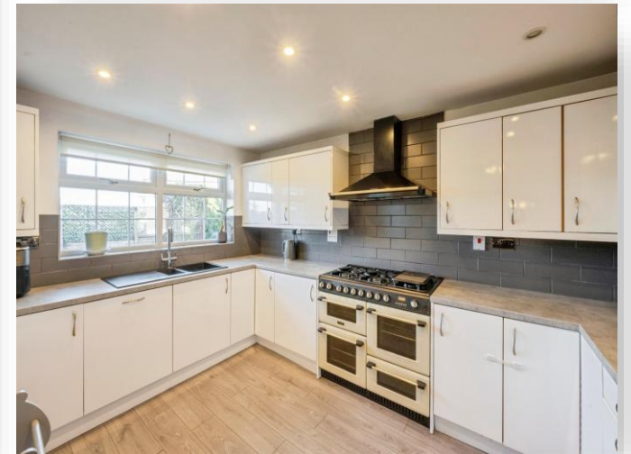
Paddock Croft, Swinton Mexborough S64 8XD