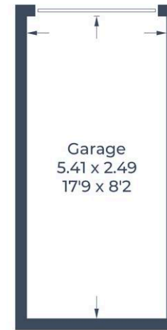
(Not Shown In Actual Location / Orientation)

Illustration for identification purposes only, measurements are approximate, not to scale. © CJ Property Marketing Produced for Chandlers