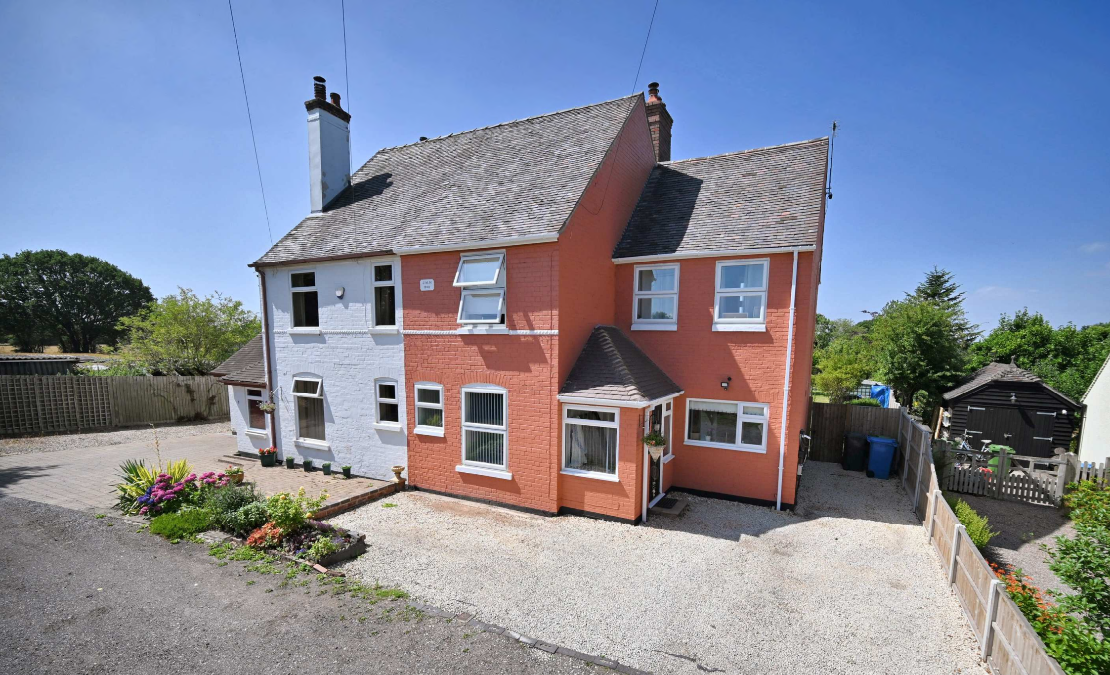
6 Deepmere Cottages, Wrotesley Road West