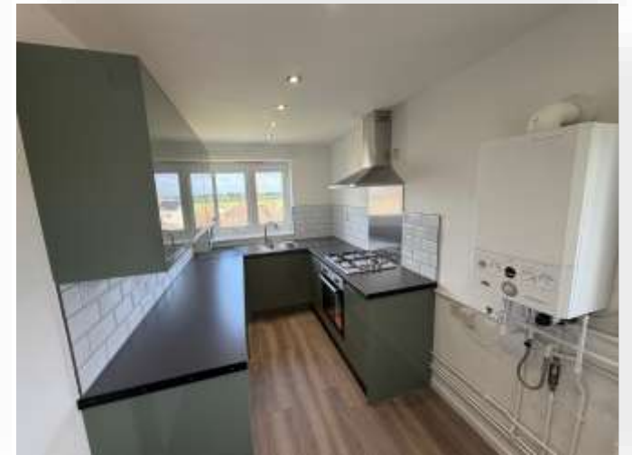
Appleyard, Peterborough PE2 8JJ