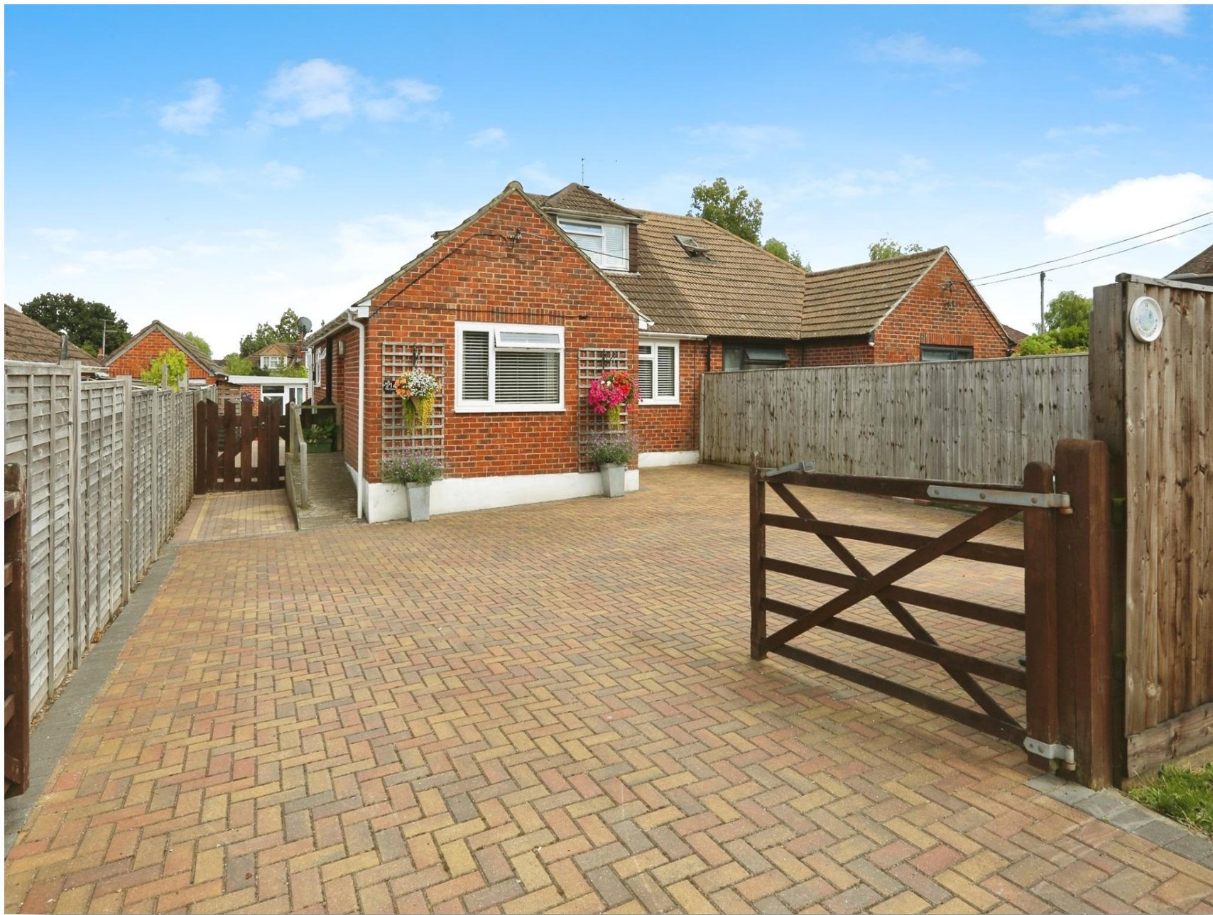
Forest Gardens, Waltham Chase, Southampton, SO32 2LB