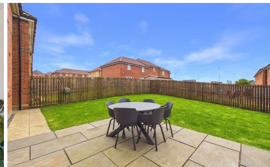
6 CORNCRAKE DRIVE, WHITBY- 4 bed Detached House -£359,950