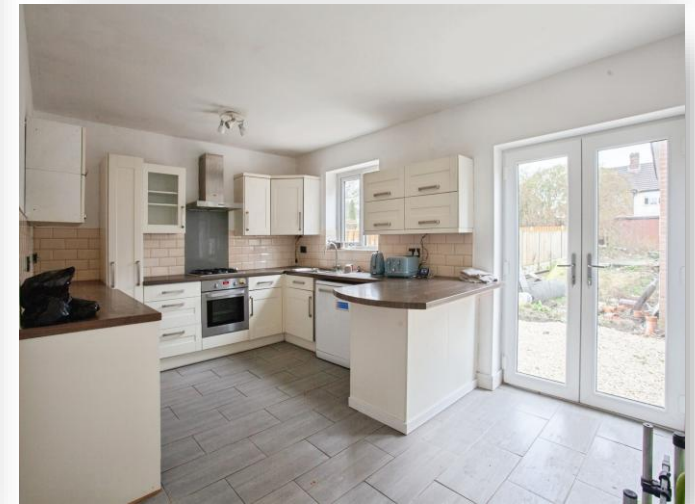
The Wellway, Sunnyside Rotherham S66 3QX