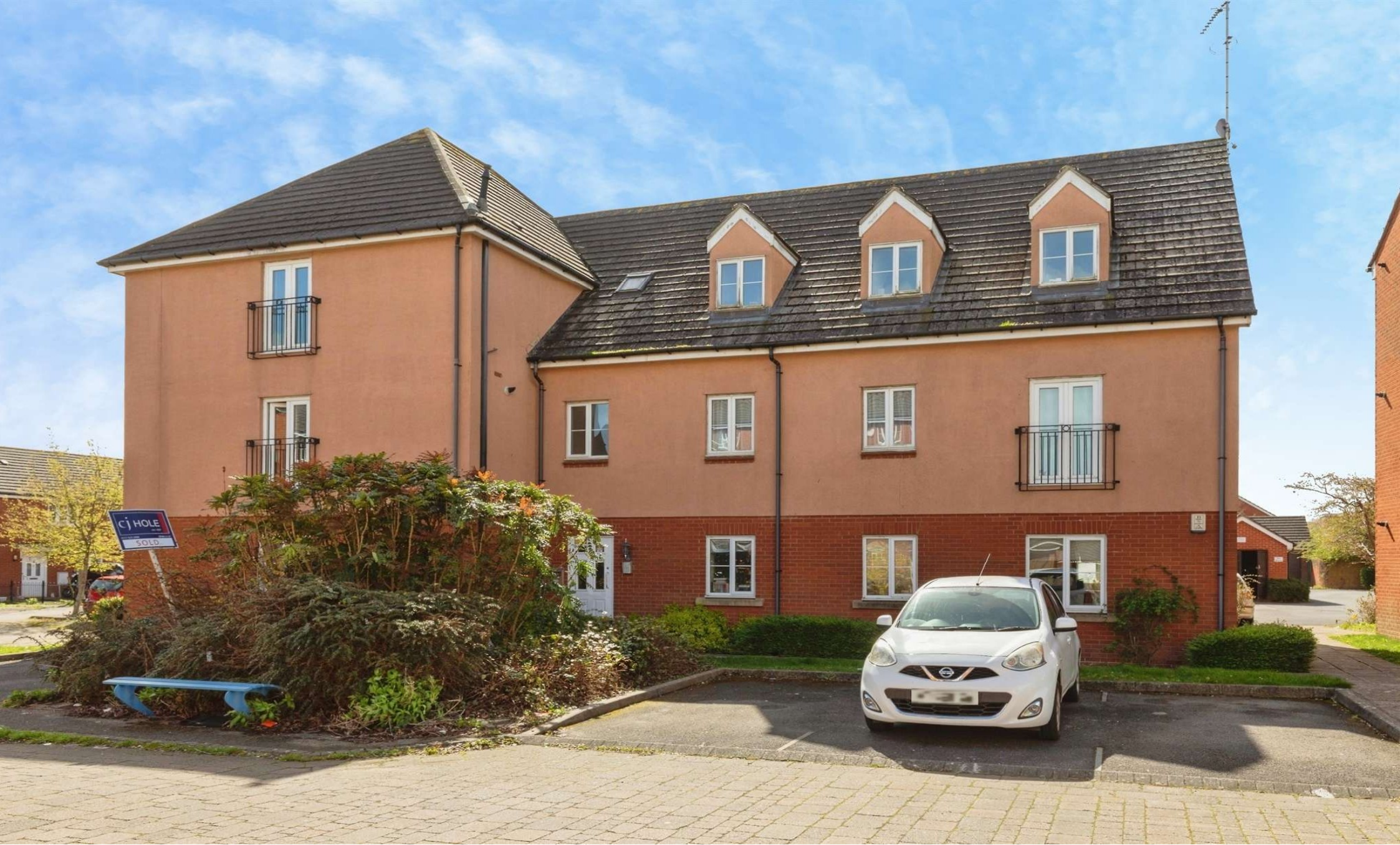
Shakespeare Avenue, Bristol BS7 0NS