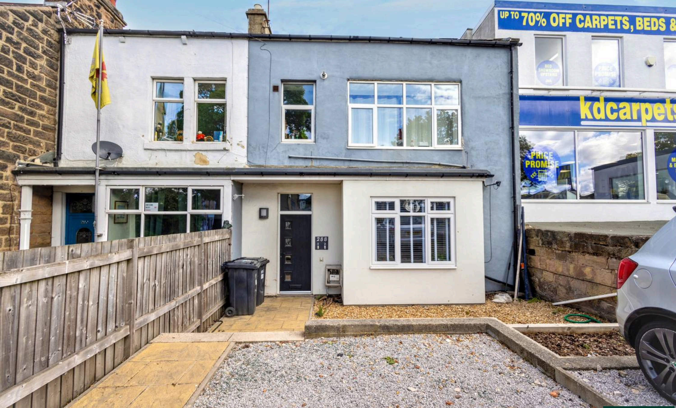
Flat 1, 288 Skipton Road, Harrogate £240,000