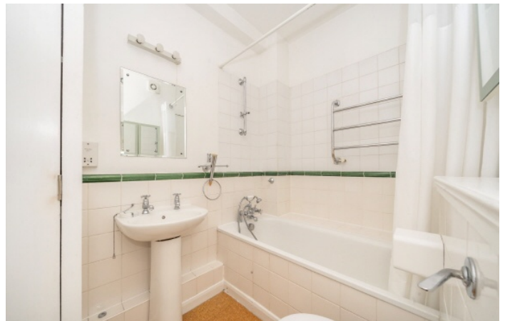
Palace Gardens Terrace, W8