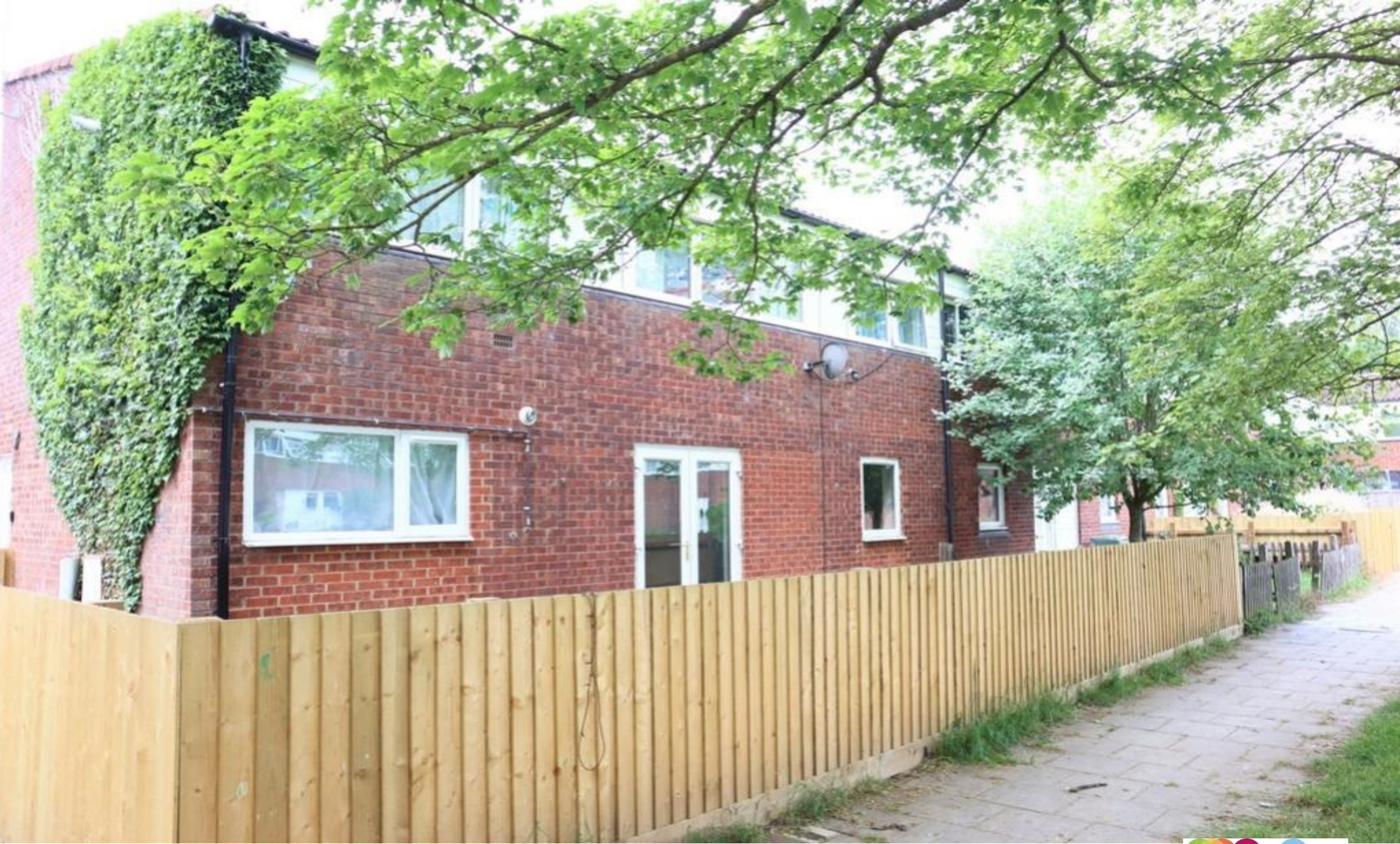
Wainers Croft, Greenleys Milton Keynes MK12 6AL