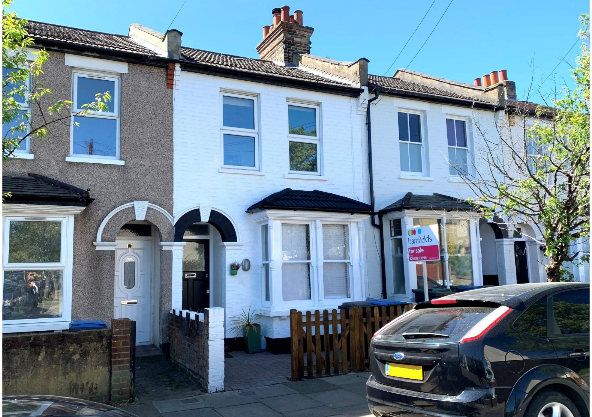
Cross Road, Enfield, EN1 1PD