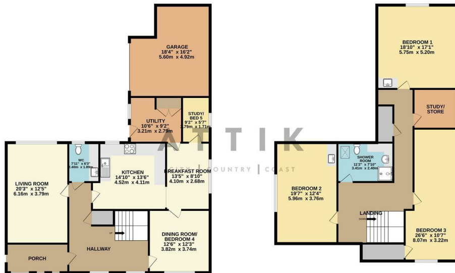
1ST FLOOR 1245 sq.ft. (115.7 sq.m.) approx.

TOTAL FLOOR AREA: 2716 sq.ft. (252.3 sq.m.) approx.