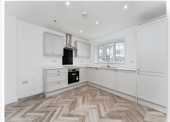
1 Spring View, Westfield Road, Manea PE15 0LS