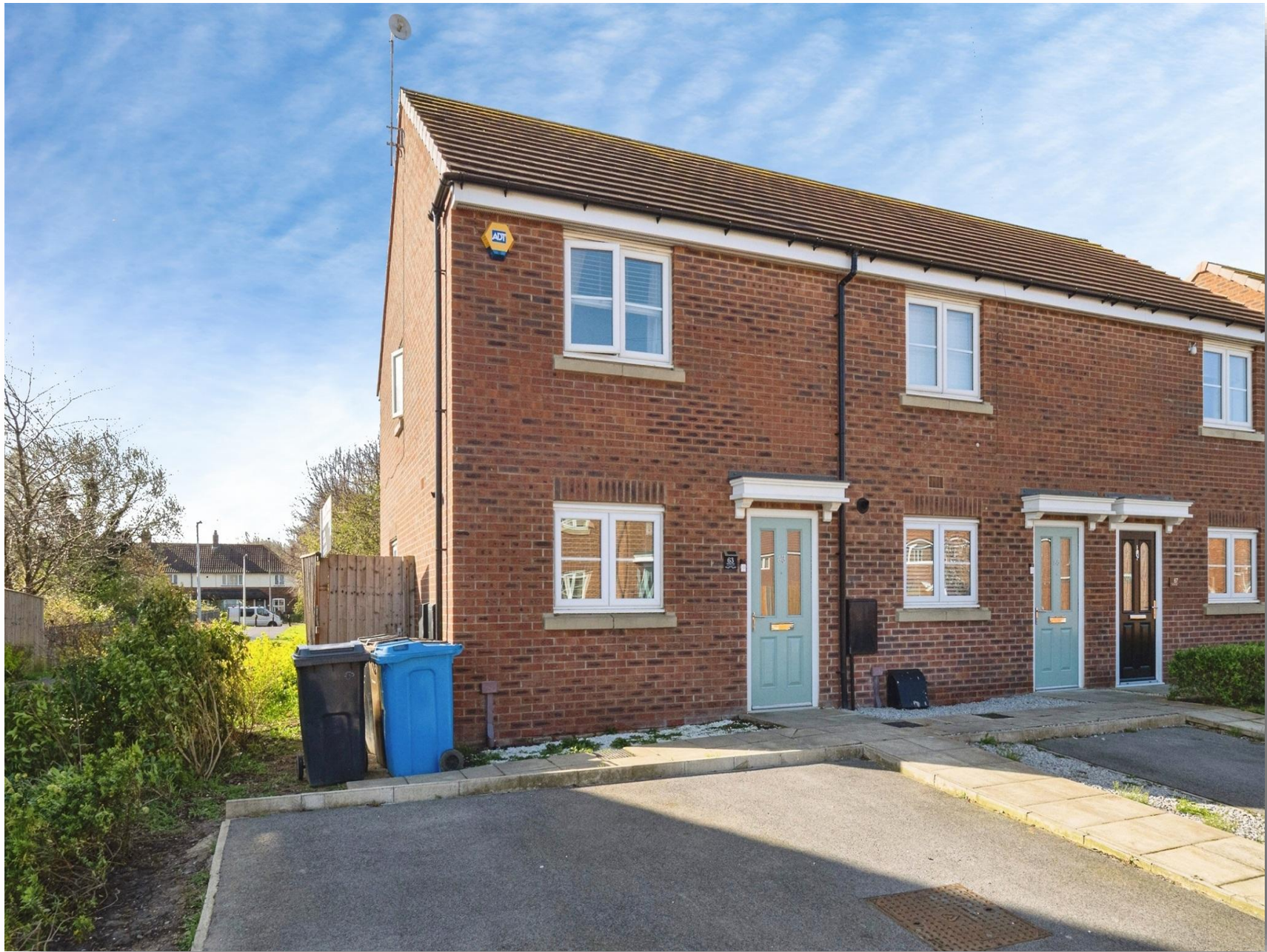
Waudby Way, Hull, HU9 4DG