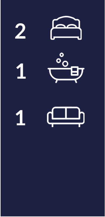
Illustration for identification purposes only. Not to scale. Floor Plan Drawn According To RIGS Guidelines.

John Ruskin Street, SE5 Approximate Gross Internal Area 66.72 SQ.M / 718 SQ.FT