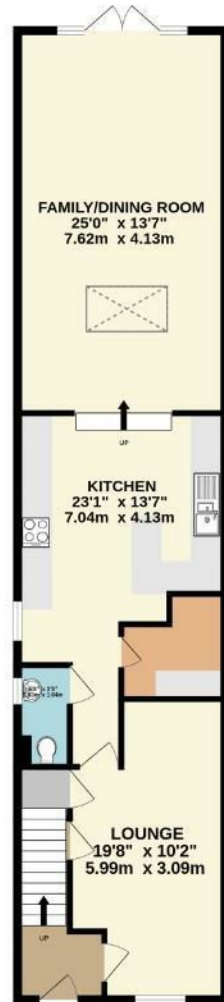
GROUND FLOOR 857 sq.ft. (79.6 sq.m.) approx.