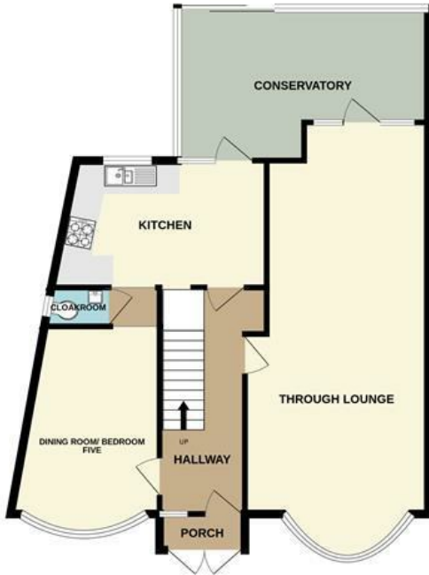
TOTAL FLOOR AREA : 1682 sq.ft. (156.3 sq.m.) approx.

Whilst every attempt has been made to ensure the accuracy of the floorplan contained here, measurements of doors, windows, rooms and any other items are approximate and no responsibility is taken for any error, omission or mis-statement. This plan is for illustrative purposes only and should be used as such by any prospective purchaser. The services, systems and appliances shown have not been tested and no guarantee as to their operability or efficiency can be given.