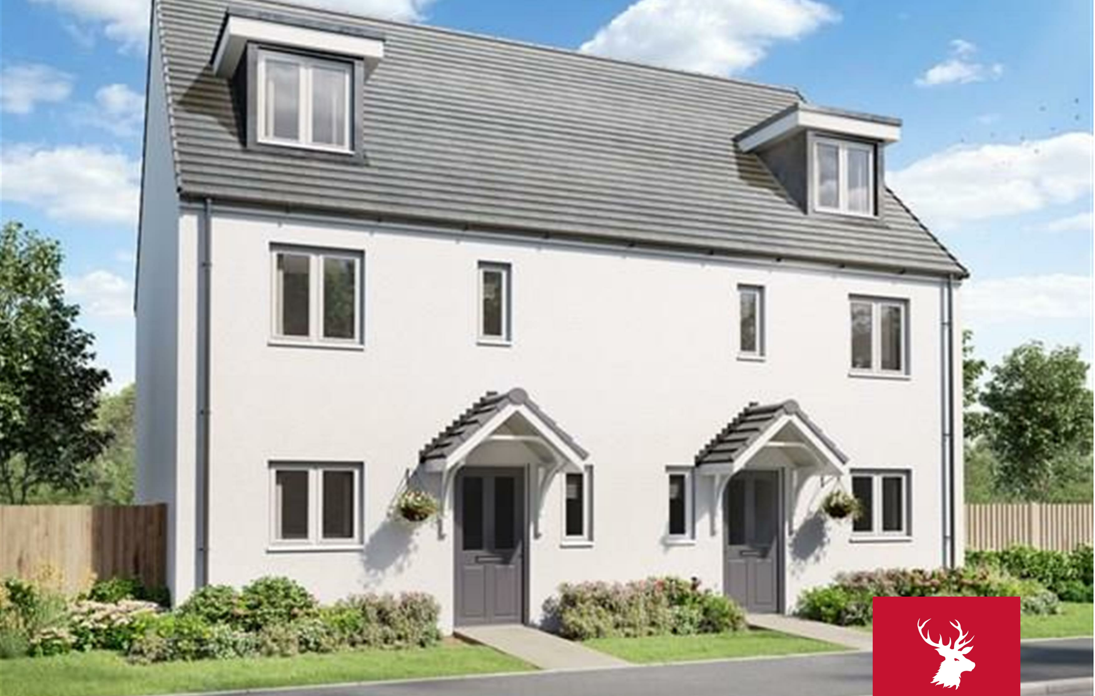
The Whinfell, plot 78