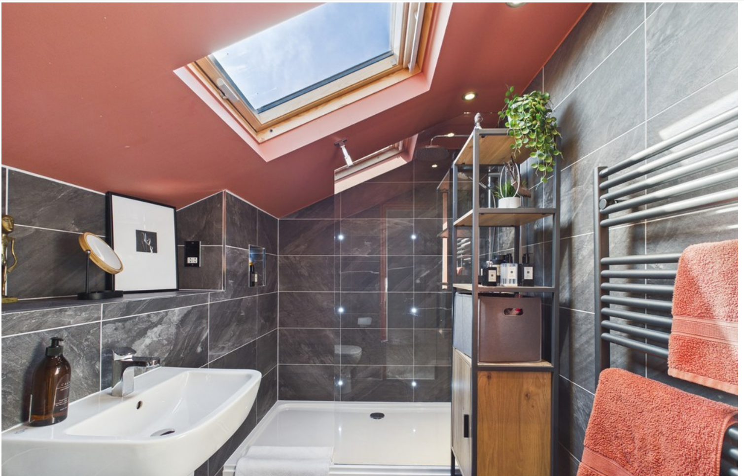
Bedroom One En-suite