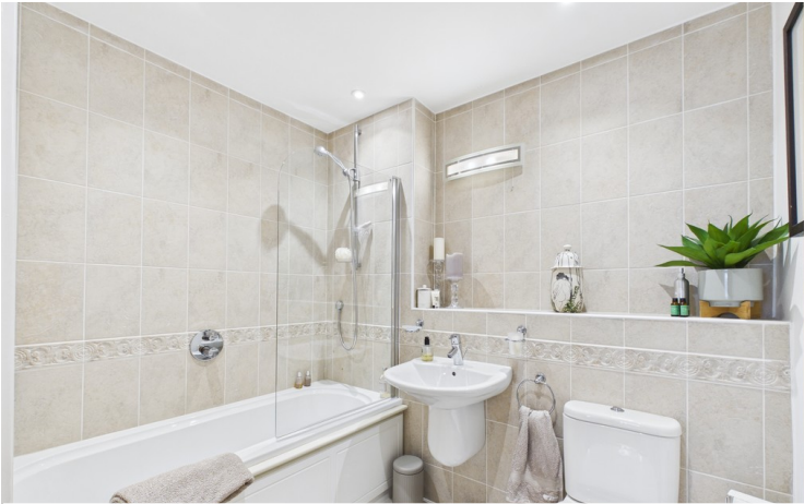
Bedroom Two En-suite