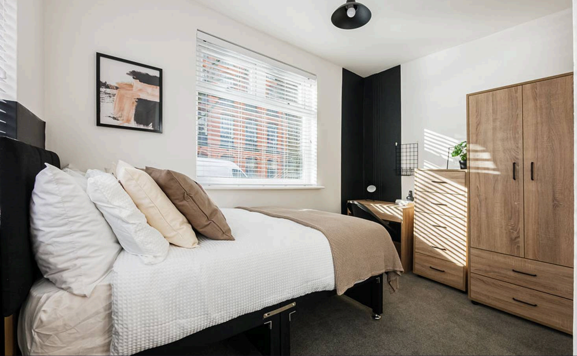
Room 2, Radford Boulevard, Nottingham £550 pcm