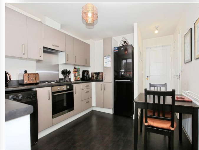
Blacksmith Mews, Peterborough PE4 7EZ