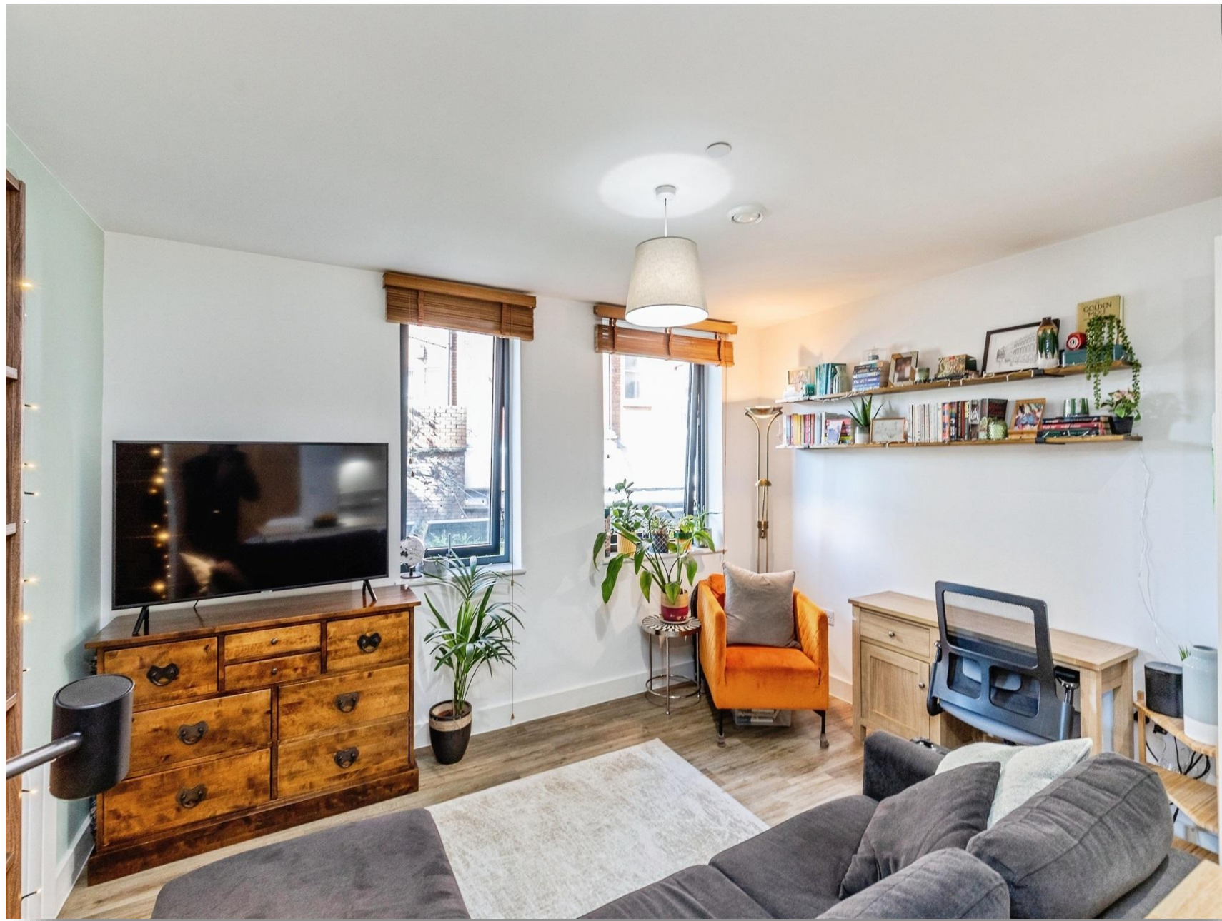
Beckford House Carmen Beckford Street, Bristol BS1 3FD