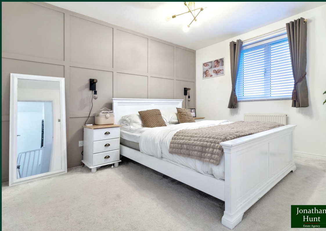
Jonathan Hunt Estate Agency