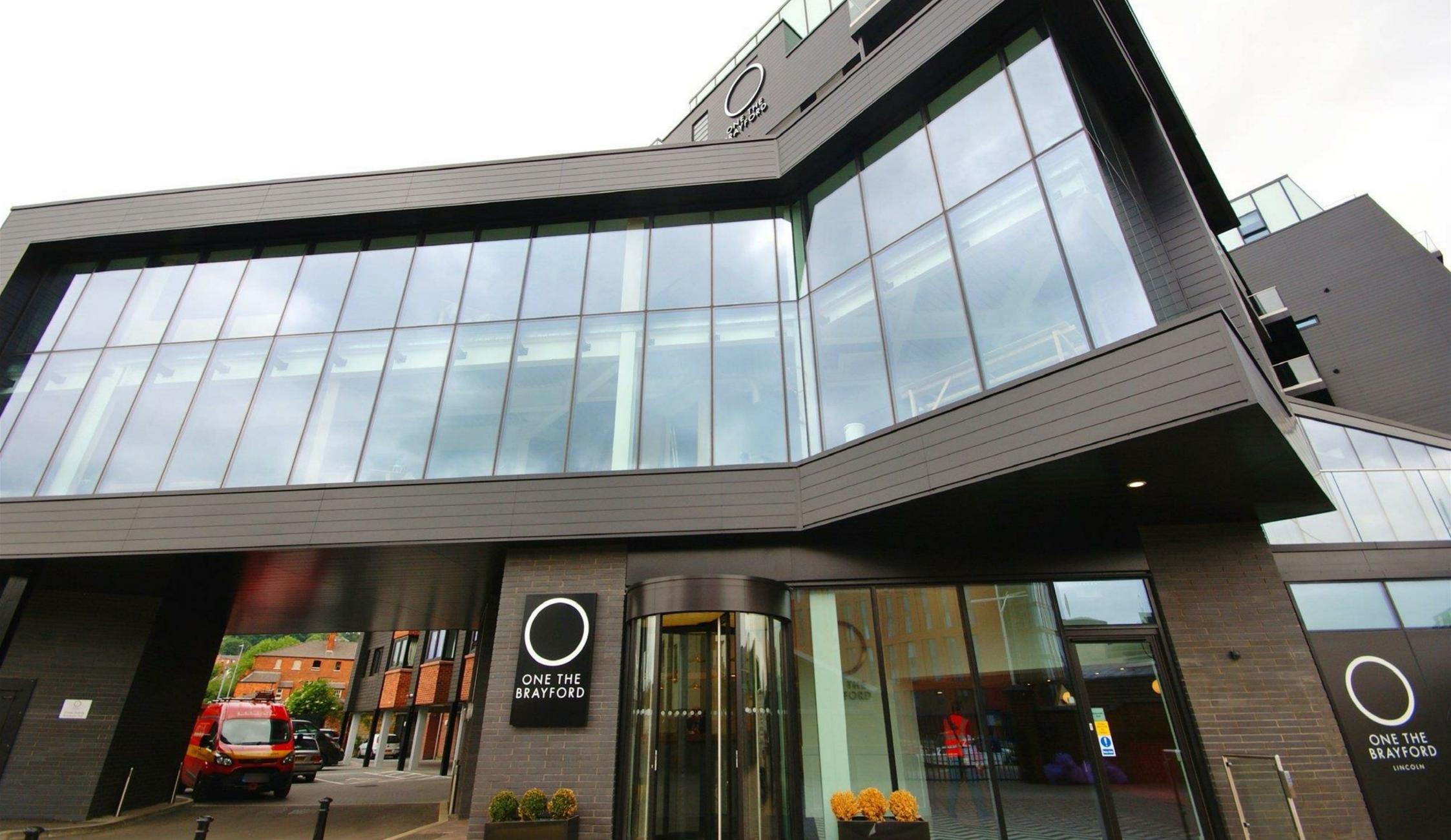
One The Brayford, City Centre, Lincoln