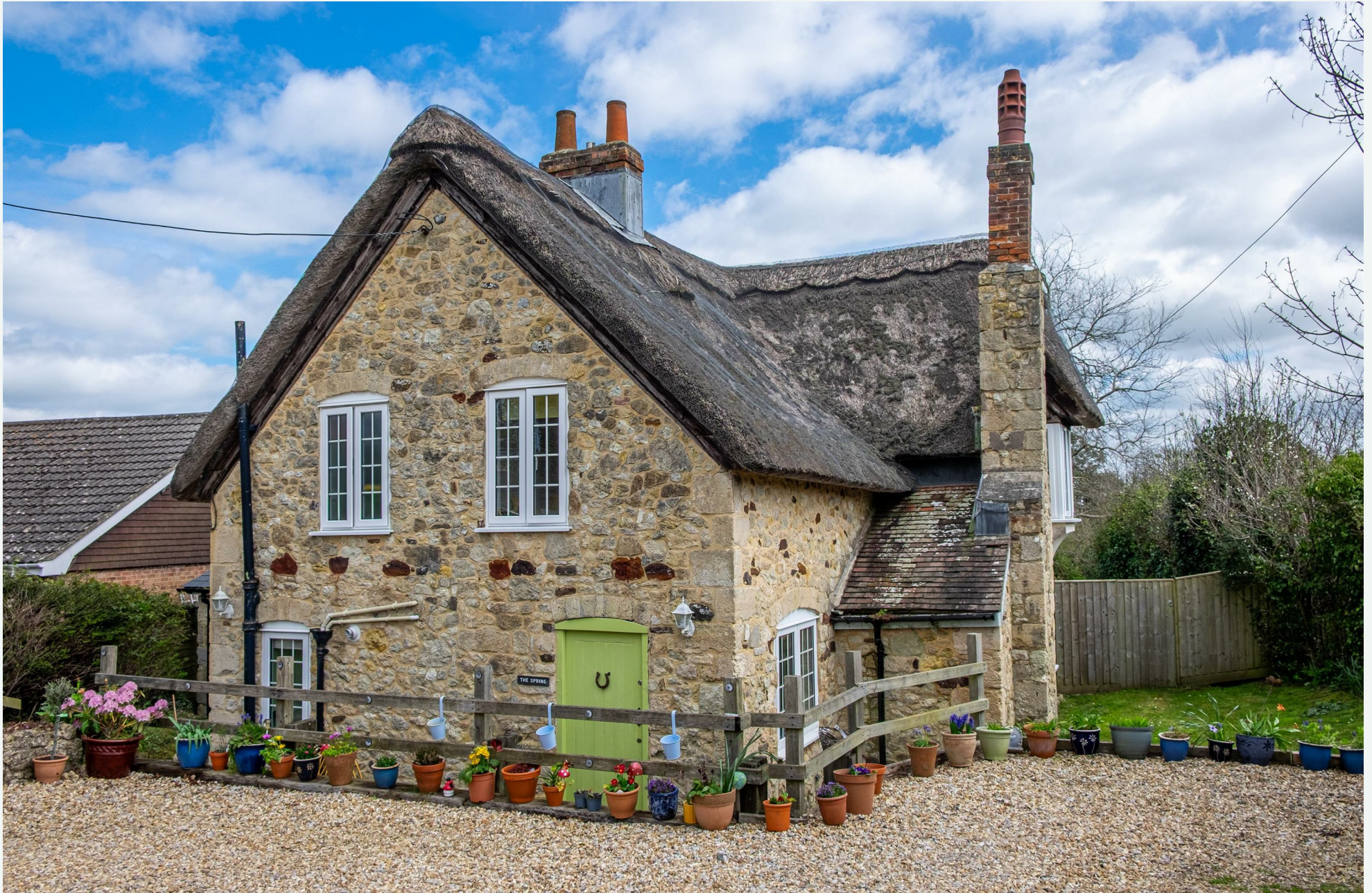
The Spring, Summers Lane, Totland Bay, Isle of Wight