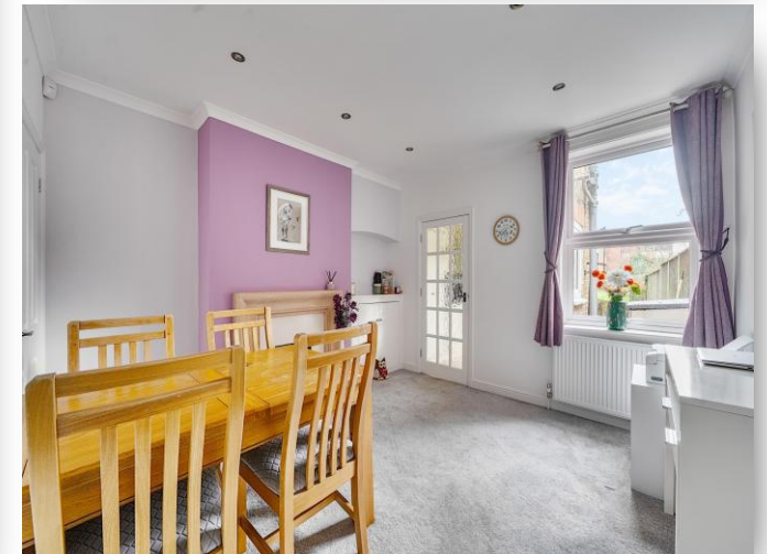
81 Penyston Road, Maidenhead SL6 6ED