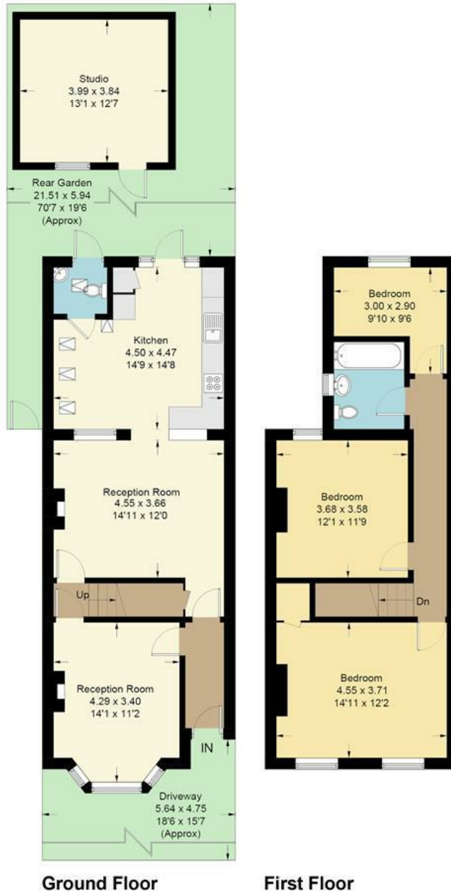
Illustration for identification purposes only, measurements are approximate, not to scale. Fourlabs.co © (ID1301879)