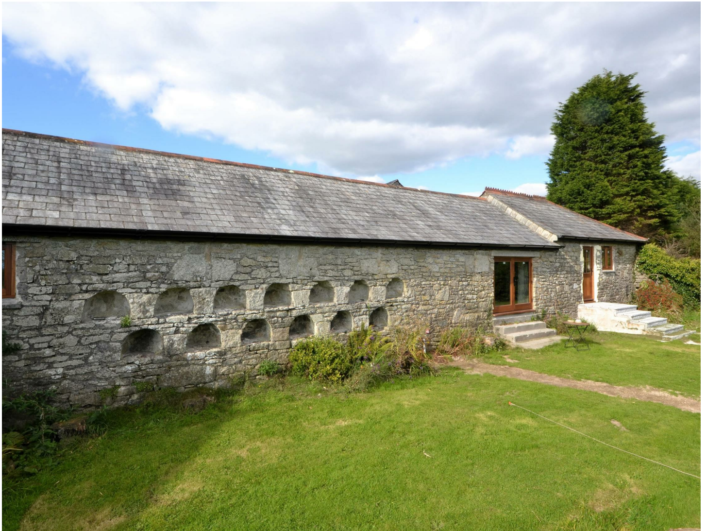
Bee Bole Barn