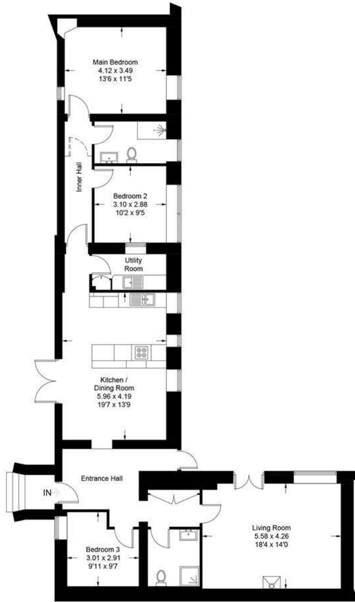
Illustration for identification purposes only, measurements are approximate, not to scale. Fourlabs.co © (ID1263931)

Approximate Gross Internal Area = 125.6 sq m / 1352 sq ft