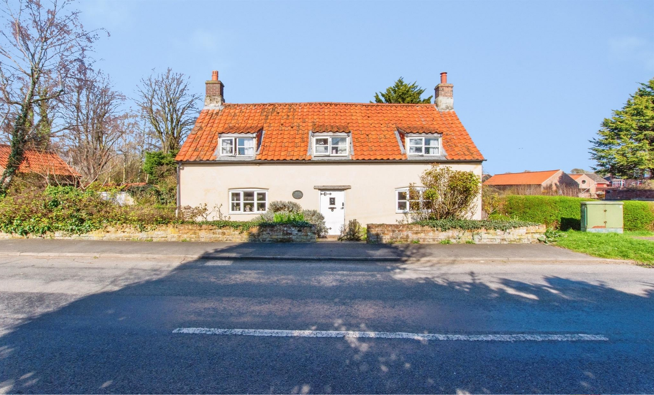
Rose Cottage Red Lion Street, Bicker Boston PE20 3DR