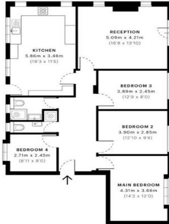
— First Floor