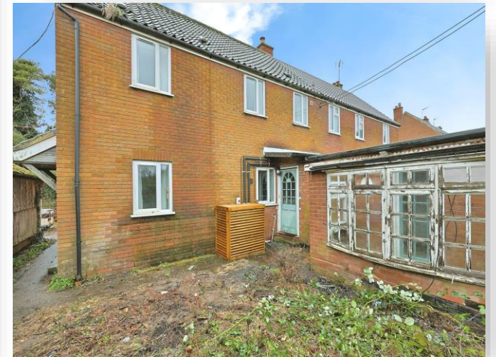
Pine Avenue, Cockley Cley, Swaffham, PE37 8AP