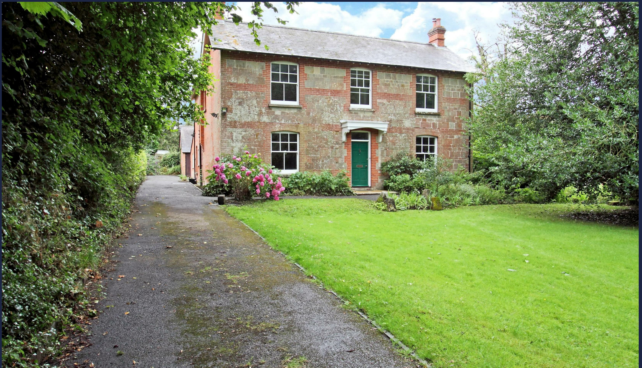
The Rectory, Shaftesbury Road, Salisbury