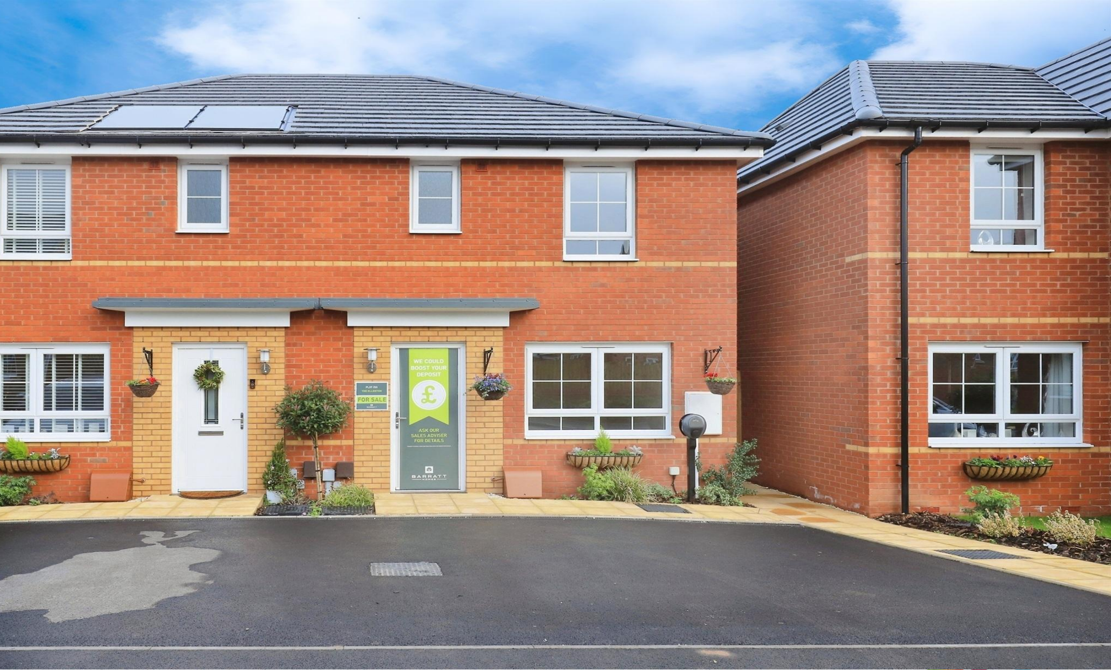
Ellerton The Pearls, Dunley Stourport-On-Severn DY13 0TT