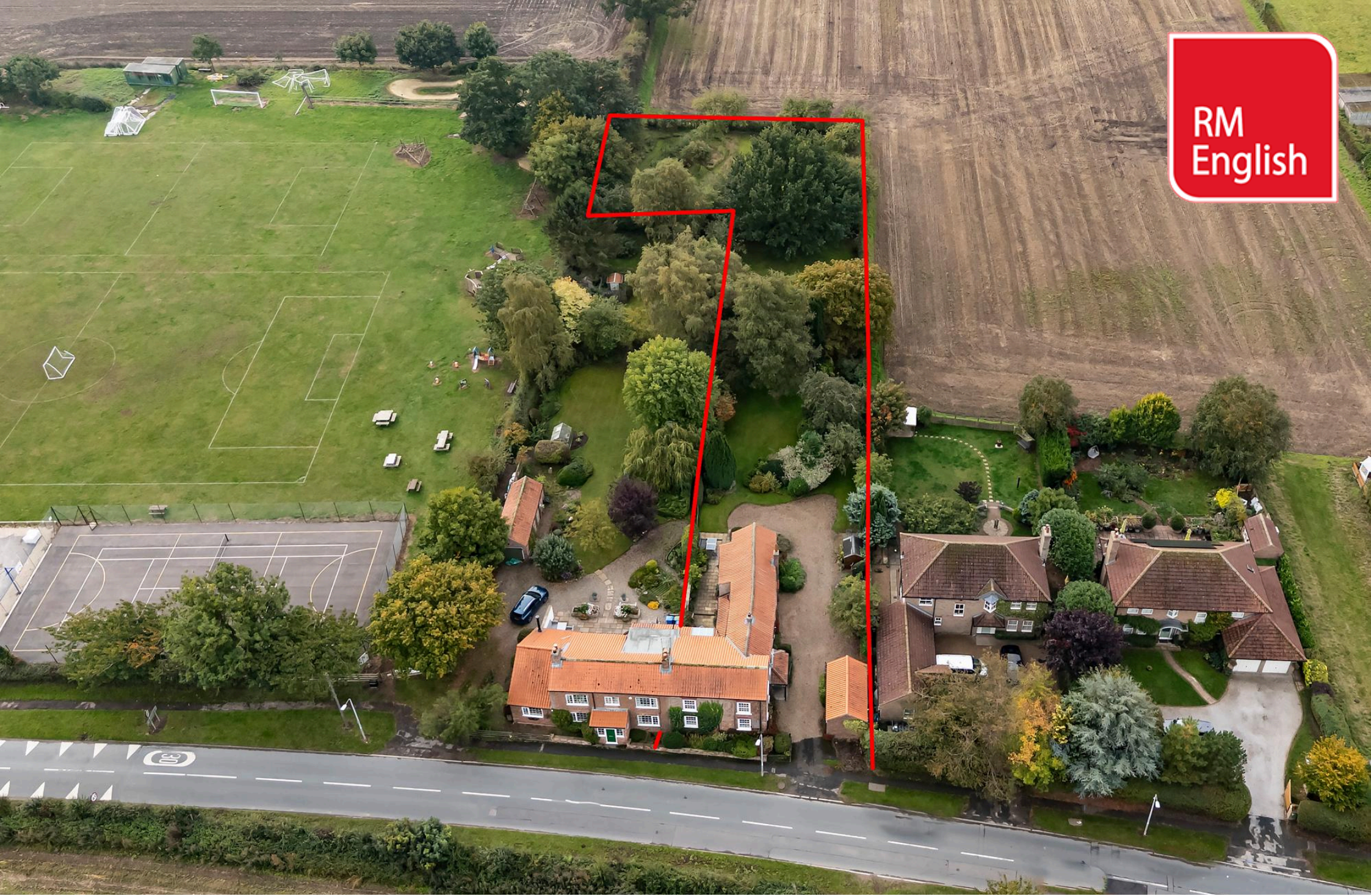
Main Street, Melbourn, York, YO42 4RD