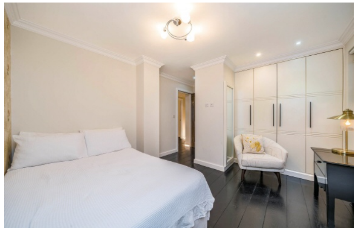
Hyde Park Gate, SW7