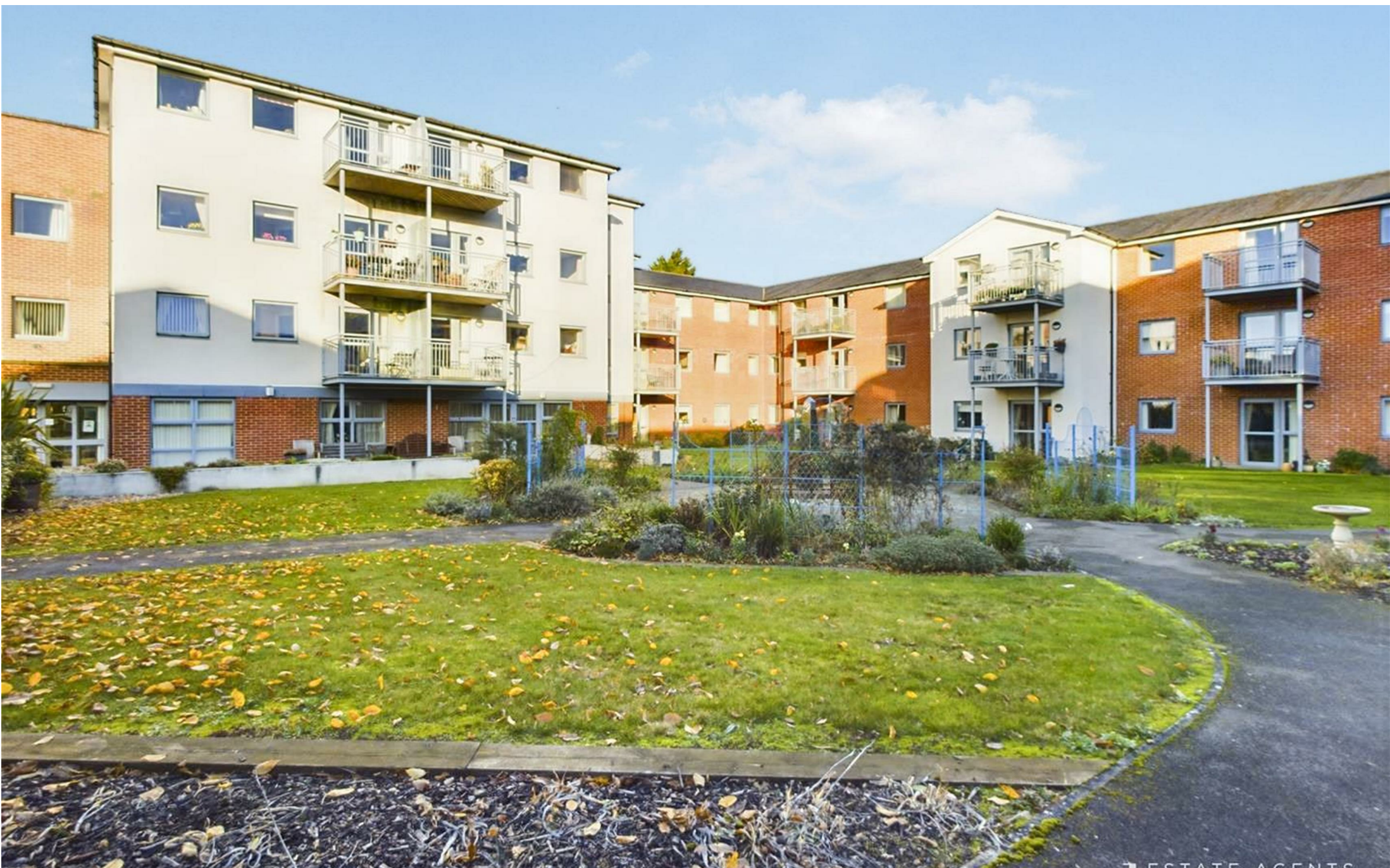
Lady Susan Court, New Road, Basingstoke, RG21 7PF