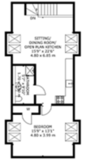
GARAGE FIRST FLOOR