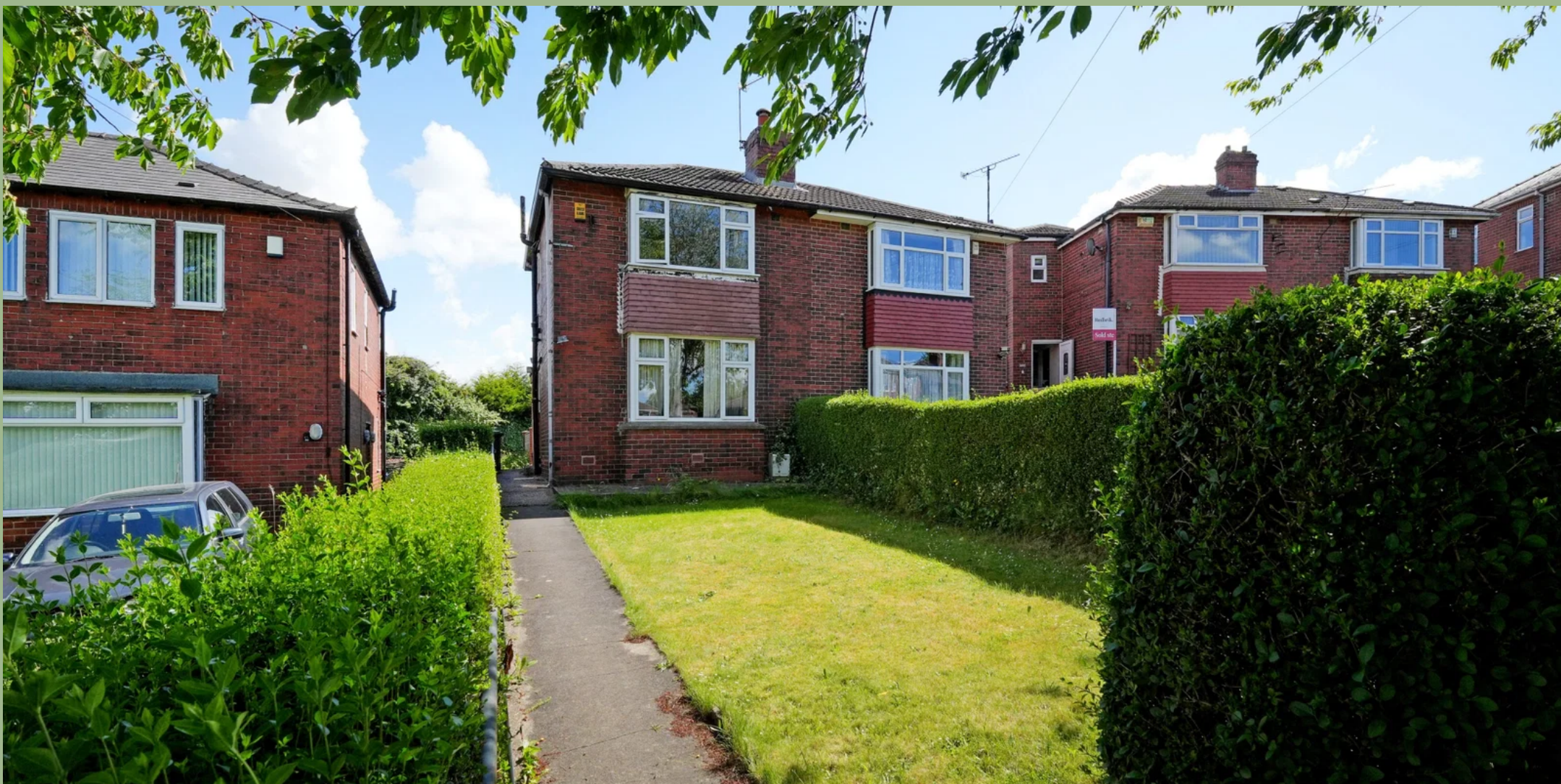
Newlands Drive, Intake Sheffield