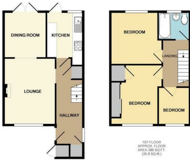
GROUND FLOOR APPROX. FLOOR AREA 424 SQ.FT. (39.4 SQ.M.)