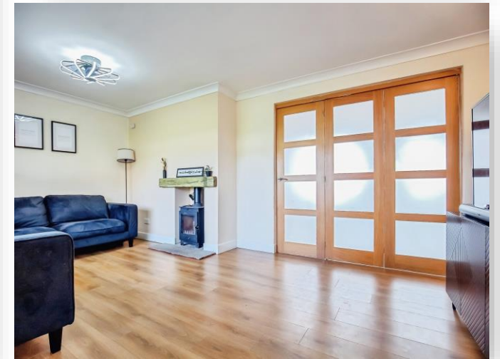
Holmfirth Walk, Corby NN18 0PB