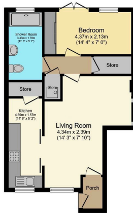
Floor Plan Floor area 51.5 sq.m. (554 sq.ft.)

Total floor area: 51.5 sq.m. (554 sq.ft.)