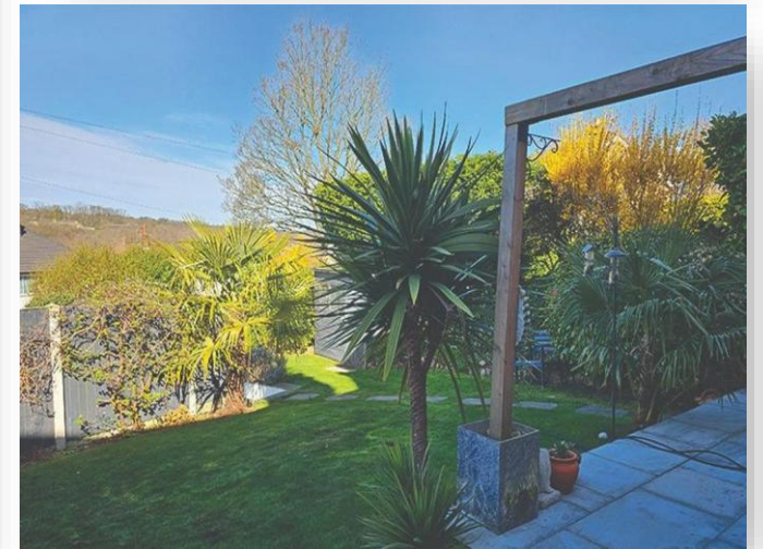
Tinshill Road, Leeds LS16 7LE