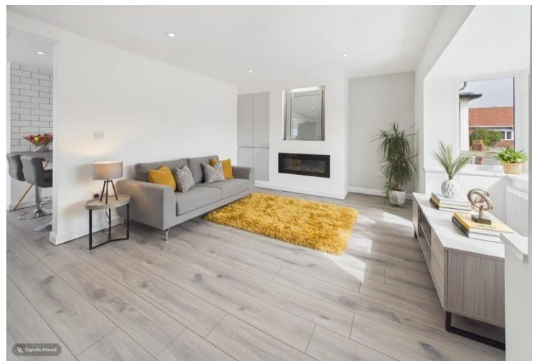
Virtually Staged Lounge Area