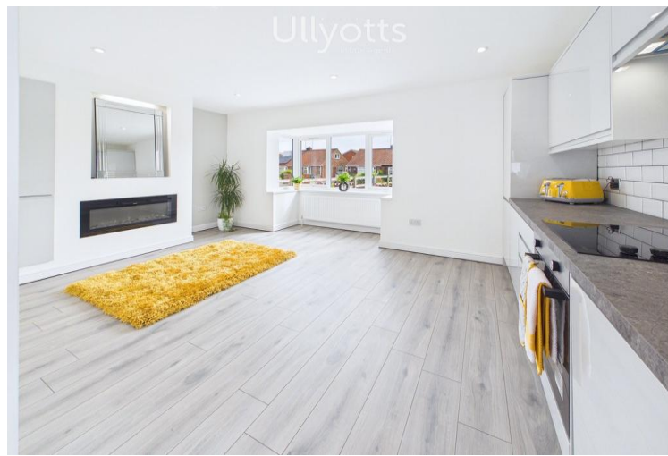
Open Plan Lounge/Dining/Kitchen