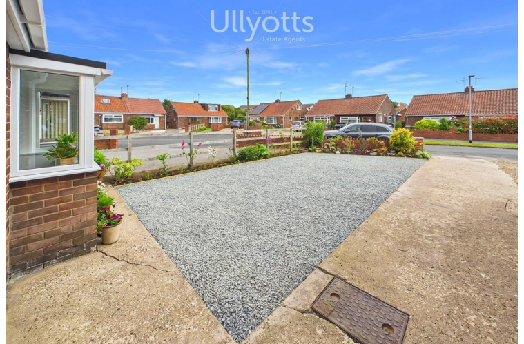
Parking To The Front

interest and kerb appeal throughout the year.