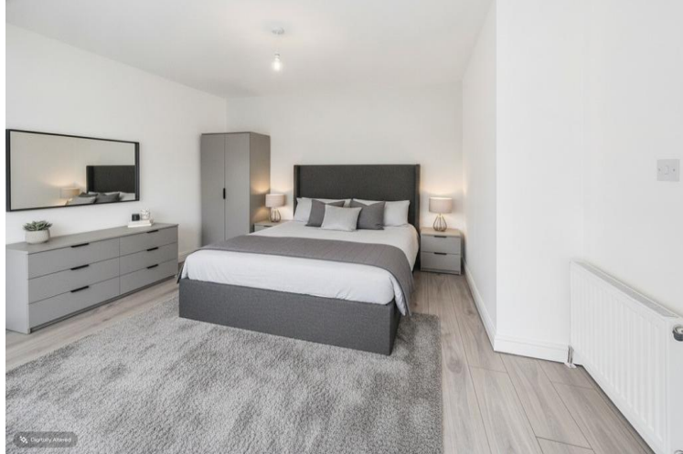
Virtually Staged Bedroom