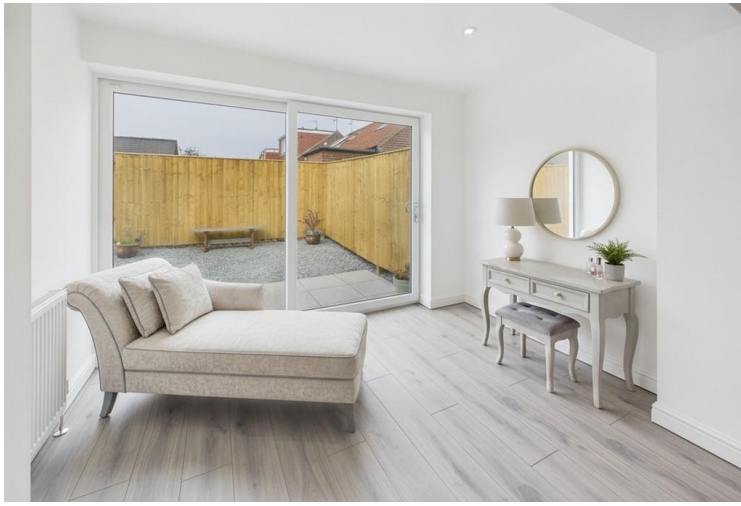
Virtually Staged Sunroom / Dressing Area