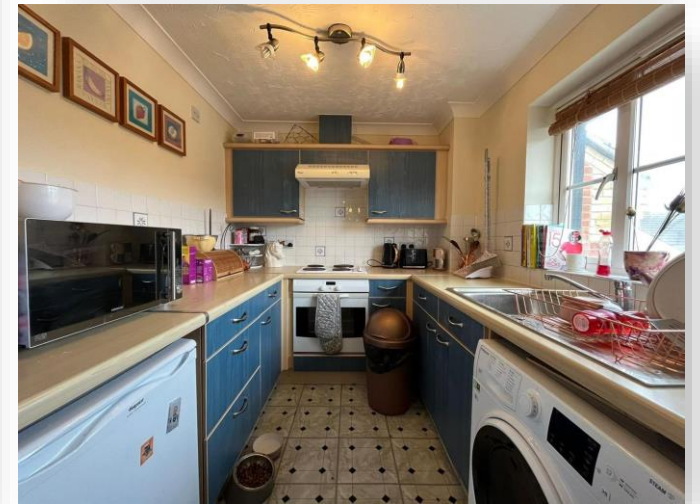
Swallowtail Close, Pinewood, Ipswich, IP8 3QX