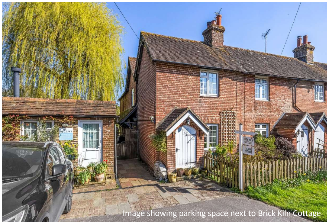
Image showing parking space next to Brick Kiln Cottage