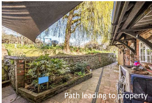
Path leading to property