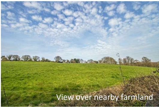
View over nearby farmland