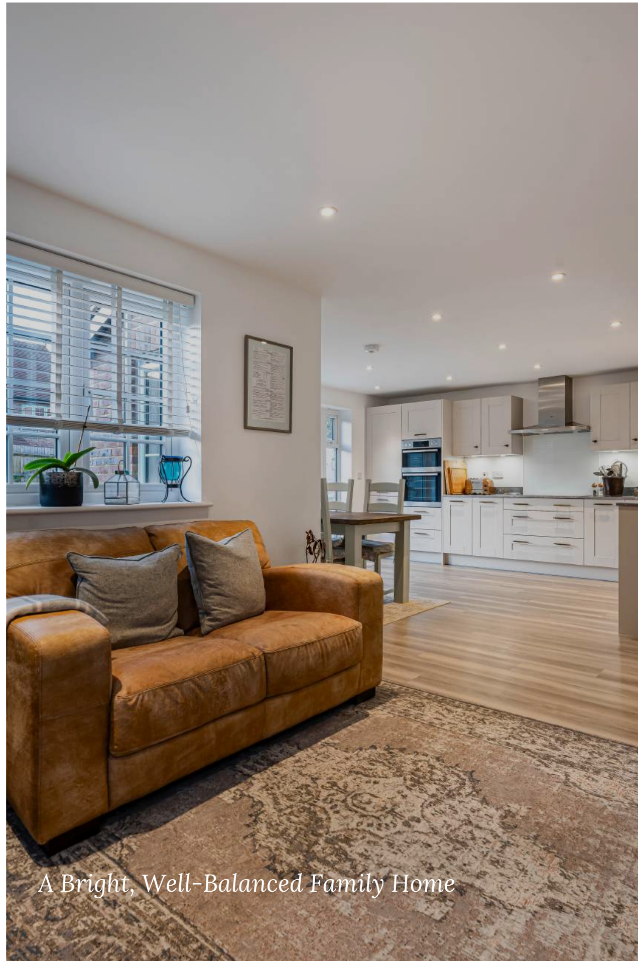
A Bright, Well-Balanced Family Home