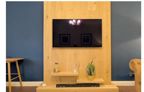
GOLF | CHARLOTTE HOUSE, GROUND FLOOR, 35-37 HOGHTON STREET, SOUTHPORT, MERSEYSIDE, PR9 0NS