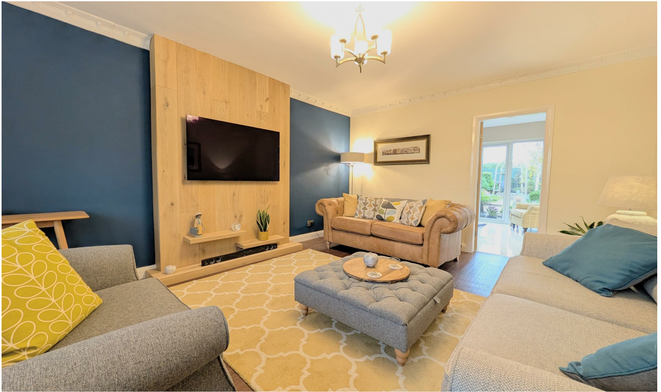
GOLF | CHARLOTTE HOUSE, GROUND FLOOR, 35-37 HOGHTON STREET, SOUTHPORT, MERSEYSIDE, PR9 0NS