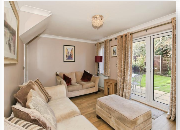
Bath Road, Eye PETERBOROUGH PE6 7PY