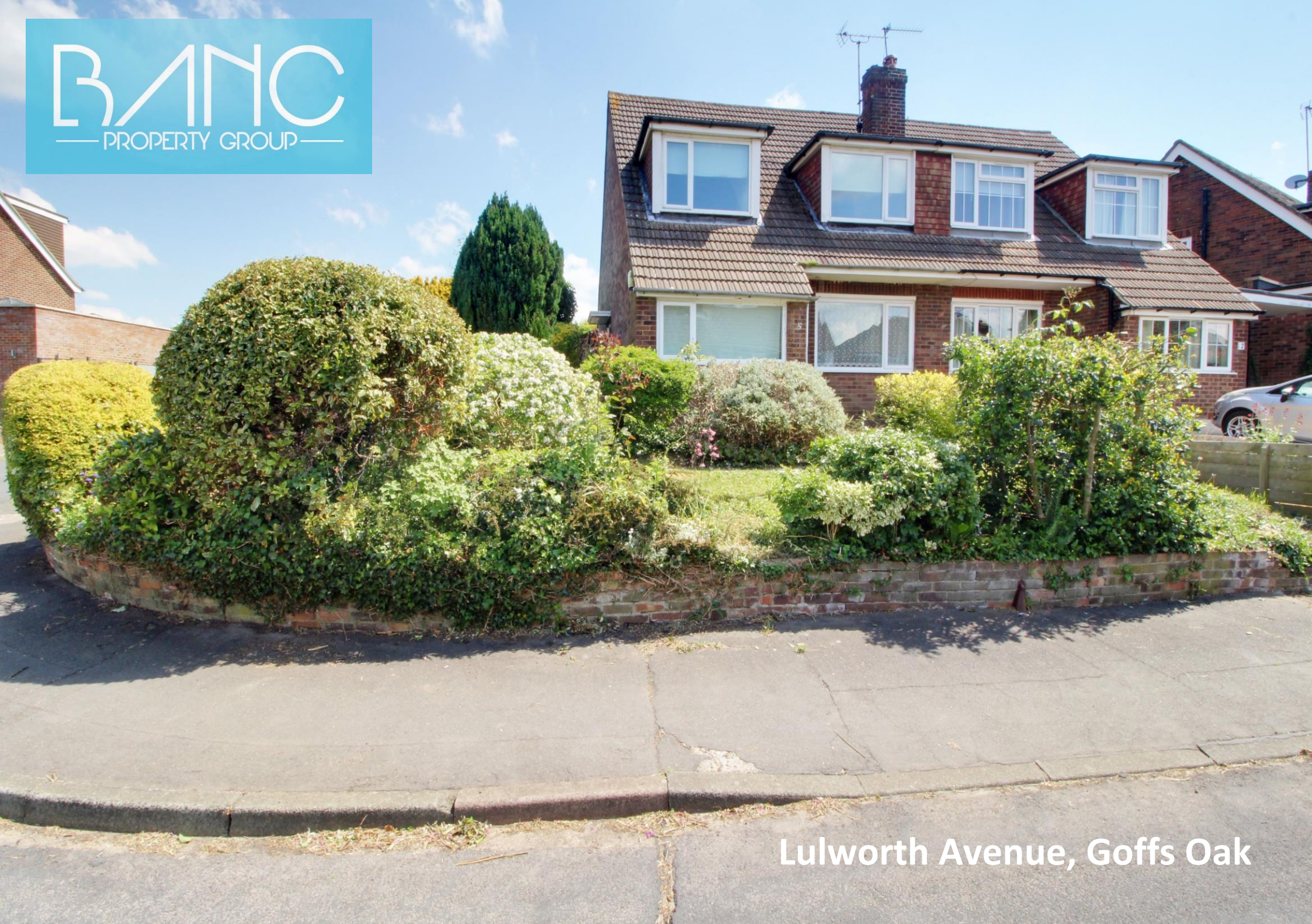
Lulworth Avenue, Goffs Oak